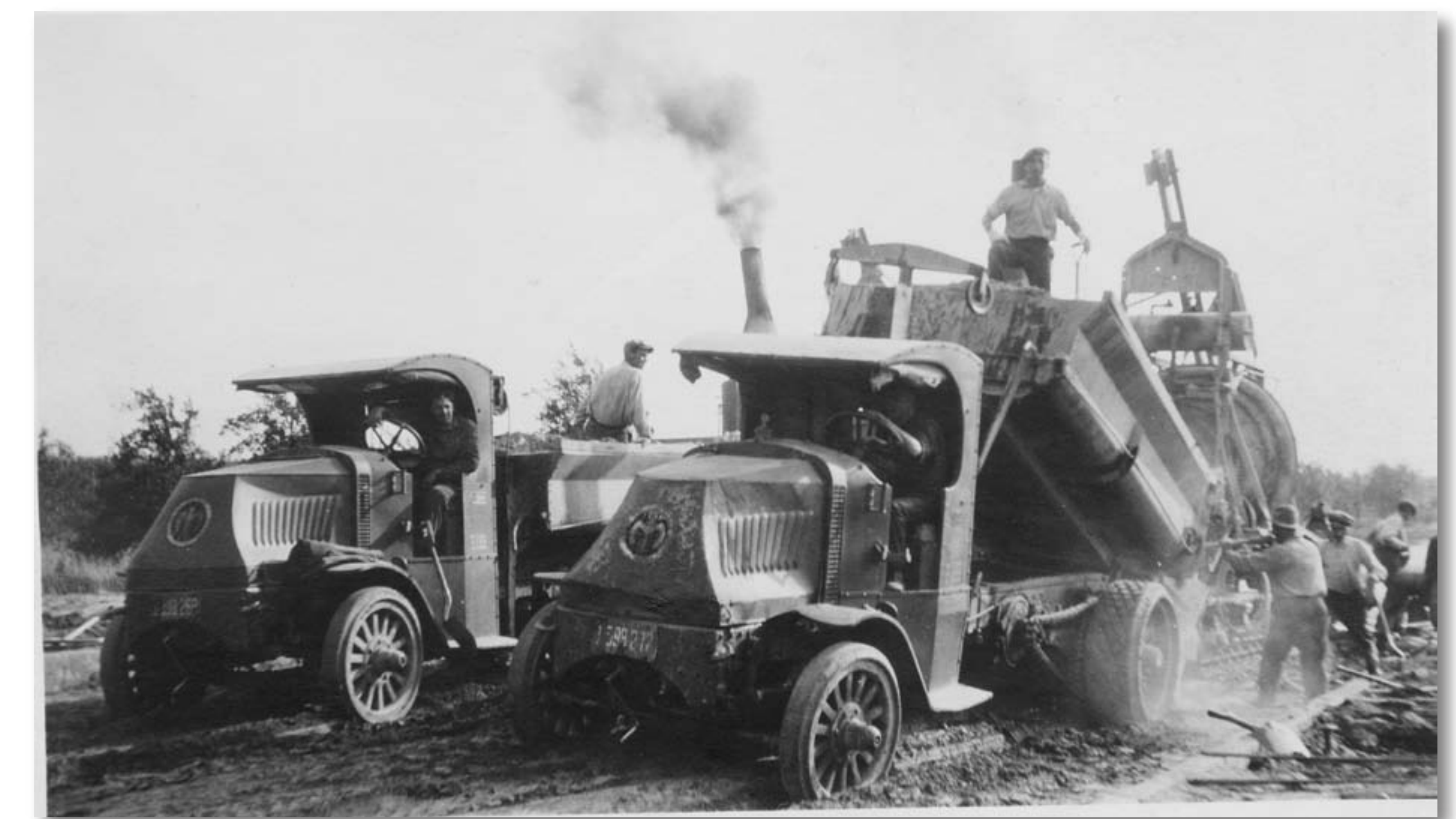
Both steam and horse power equipment were used in this 1923 - 1924 project.