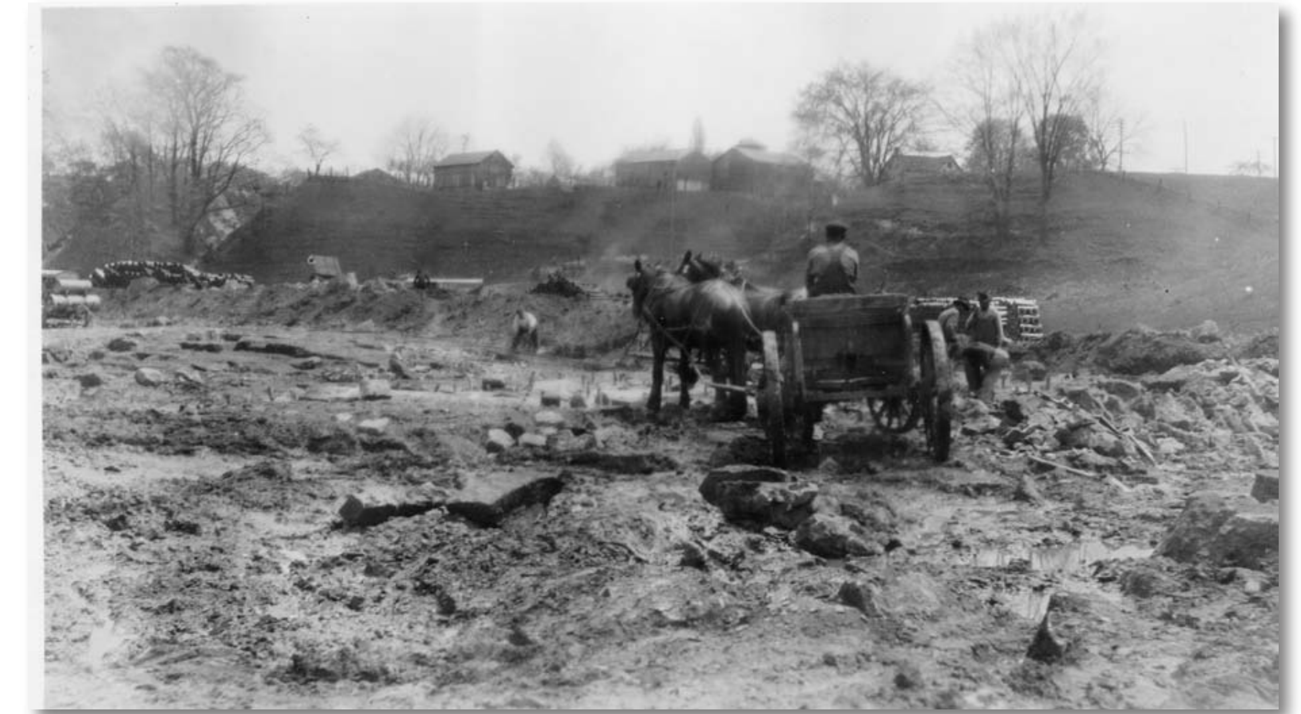
In this photo you can see the chicken farm that occupied the site that is now Harper's Mobile Home Park.