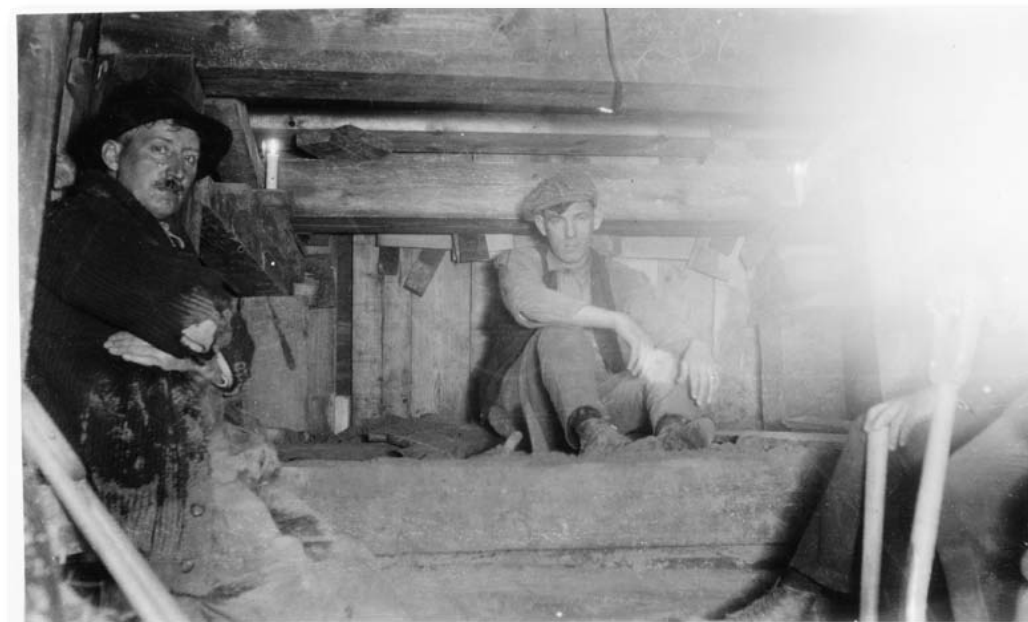
Workmen in the tunnel during construction