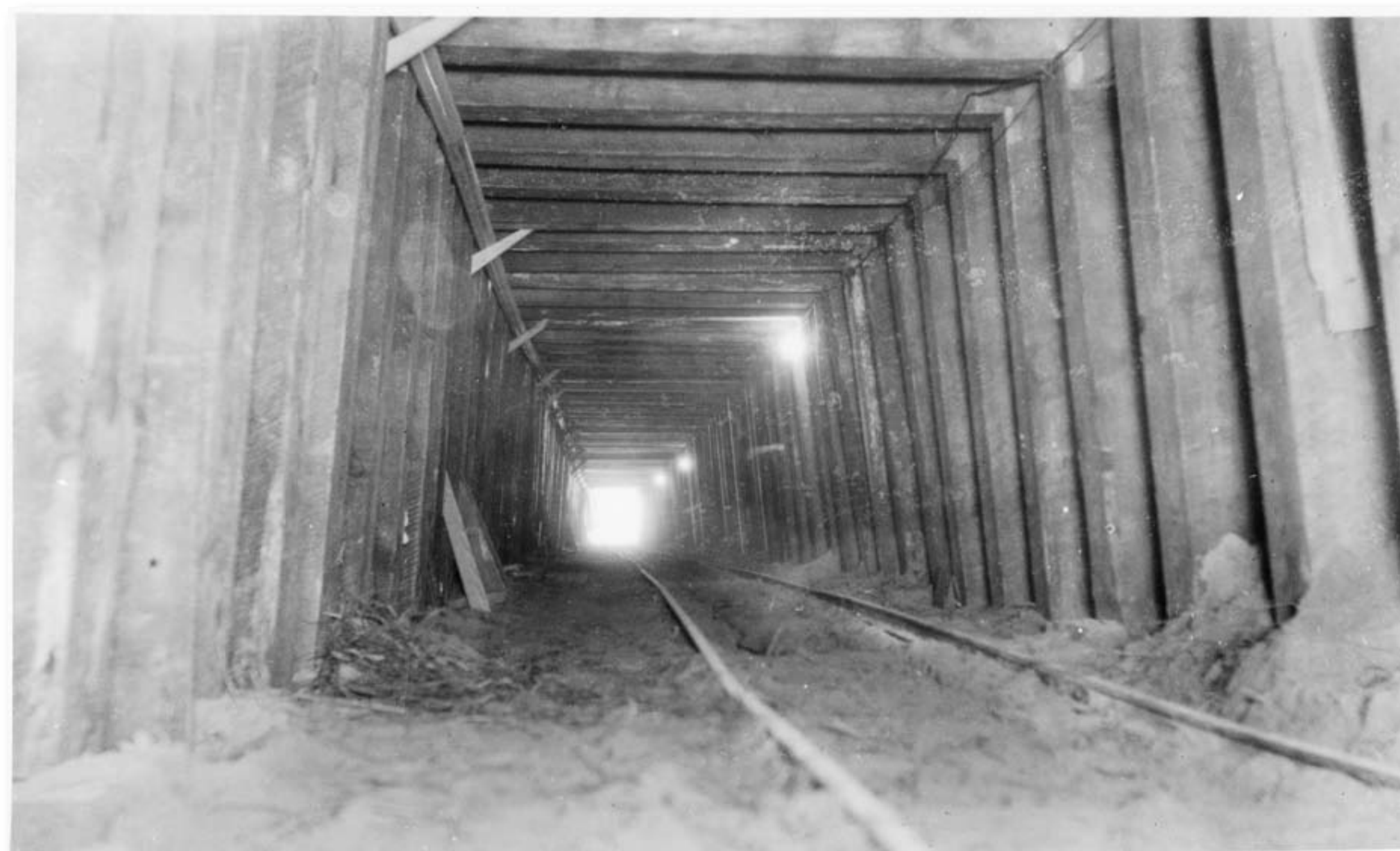
The tunnel before the pipes were laid. Note the railroad tracks that were used during construction.